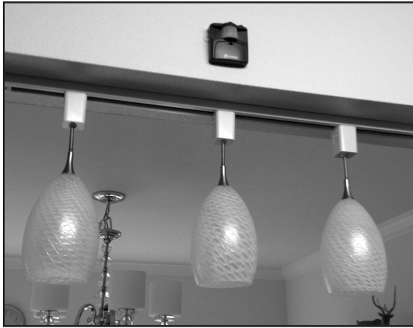
Figure 1. Motion sensor installed in the home of a study participant. This figure illustrates how a motion sensor used in the study looks after it has been installed in the kitchen of a residence.

engineer, system designer, and senior support technician with doctoral training in health informatics research. Figure 2 displays an example floor plan for sensor installation, showing the location of the gateway and five sensors with cone shaped overlays to illustrate motion detection areas. Please note that this figure is for illustrative purposes only; overlay areas are not to scale nor intended to be precise engineering representations of device motion detection behavior.